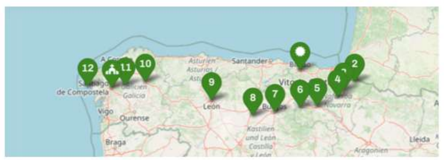
The Camino de Santiago, from Saint-Jean-Pied-de-Port to Finisterre.